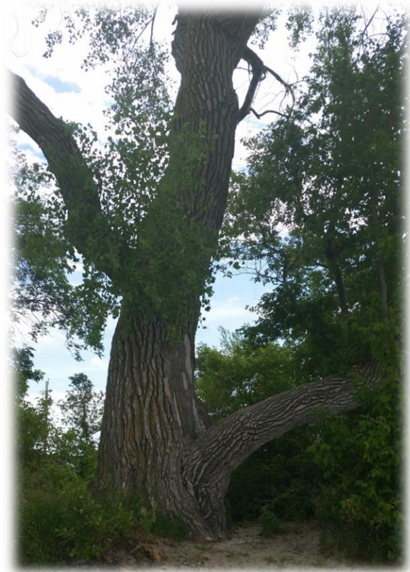
Le Gros Arbre (The Big Tree) from St. Laurent