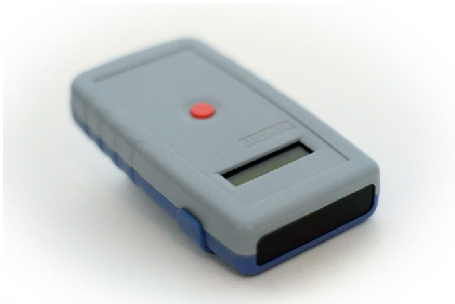
Figure 3: PIT tag

http://www.pet-detect.com/media/catalog/product/cache/1/image/1200x/040ec09b1e35df139433887a97daa66f/u/n/universa/pocket_scanner.jpg